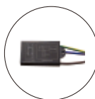
10KV SPD 120-277V