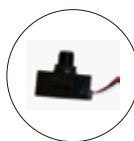
BUTTON STYLE PHOTOCELL 120-277V