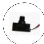
BUTTON STYLE PHOTOCELL 120-277V