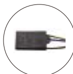
10KV SPD 120-277V