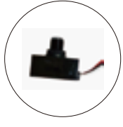
BUTTON STYLE PHOTOCELL 120-277V