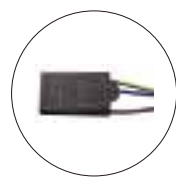
10KV SPD 120-277V