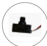
BUTTON STYLE PHOTOCELL 120-277V